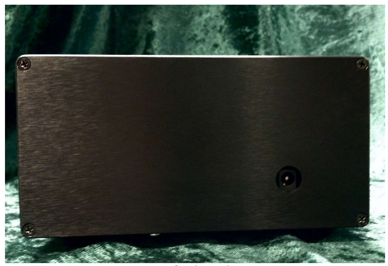
Left Side Panel POWER ADAPTER INPUT: Use only approved AC Power Adapter (18Vac 1 Amp)